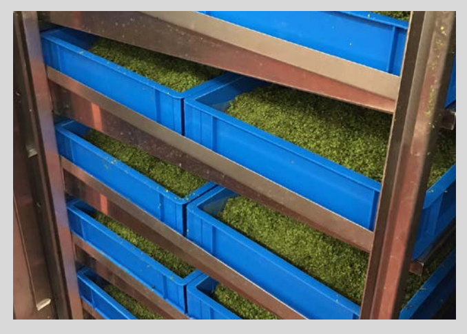
Brainwaves, Harvested Duckweed oven

Welsh Government Minister for European Transition, Jeremy Miles said "This is a great way to help the transition to a sustainable, circular economy. Through cross-border collaboration, Wales and Ireland are taking a novel, innovative approach to preserving resources, creating local jobs — and treating waste water as a resource and an opportunity to create something good."