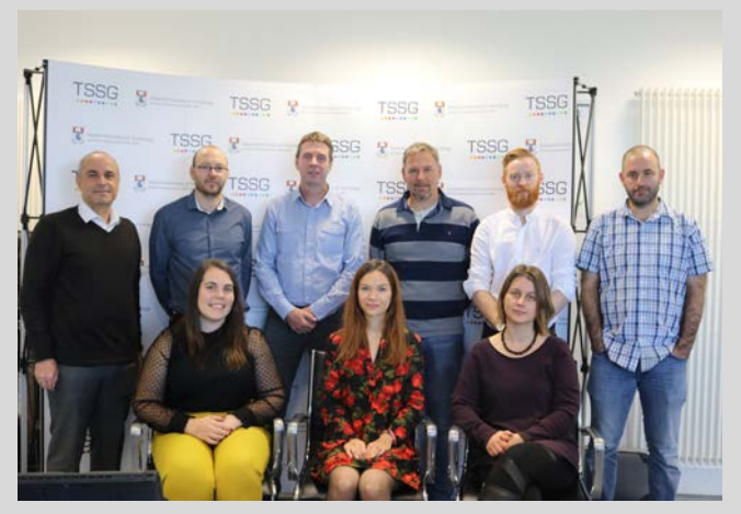
piSCES project team

The project also formed part of a wider whole system perspective developed in Pembrokeshire around the port and Milford Haven waterway where smart management and integration of multi vector energy through smart systems and digital platforms are key to future developments.