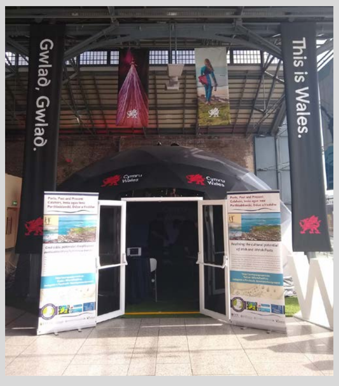
Ports, Past and Present Launch event

"By bringing life and colour to the ports through visual arts, literature and film, as well through digital technology including apps and social media, this will enhance the experience of modern travellers of all ages and interests, and encouraging people to spend more time and money in these towns."