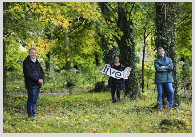
LIVE project launch

To date, the project has established a strong visual branding on digital presence on various social media channels and the team have been developing, circulating and processing an innovative survey to map public perceptions, knowledge gaps, and areas of interest on Iveragh. The preliminary results already show some interesting insights that will inform the project outputs. LIVE are also working directly with schools in both regions to develop location-specific resources to help teachers to bring local natural heritage into their classrooms and to bring their students out of the classroom into nature. LIVE is in the process of developing digital resources for each region that will enable increased engagement in and awareness of the natural heritage of these regions among residents and visitors alike.